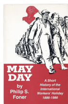
May Day A Short History of the International Workers' Holiday, 1886-1986