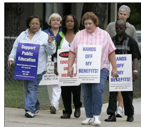
Striking Detroit teachers picket outside Cass Technical High School.