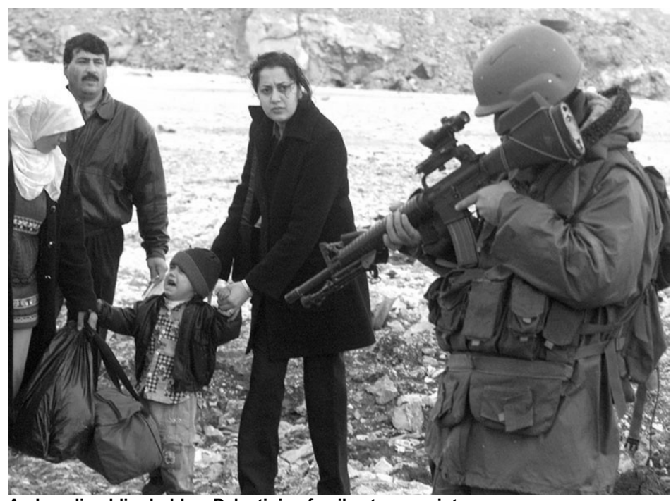
An Israeli soldier holds a Palestinian family at gun point.