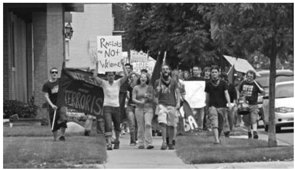
Kalamazoo residents and university students marching in response to the invasion of their community by nazis and other hate groups.

While the local corporate media and police encourage the