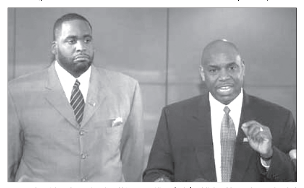
Mayor Kilpatrick and Detroit Police Chief Jerry Oliver (right) publicly address charges leveled by former Deputy Chief Gary Brown at a recent press conference. Accusing the Detroit city government and its agencies of corruption and nepotism is like accusing a state prison of housing murderers and rapists. Attempting to deny that such things are taking place can only be attributed to delusion or bold-faced lying.