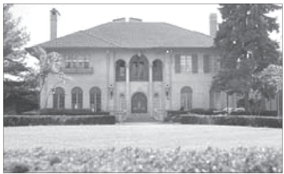
Mayor Kwame Kilpatrick (left) continues to be on the defensive over an alleged party at Manoogian Mansion (right), the mayor's residence. It is fairly obvious that all the stories about a stripper, a fistfight and alleged rowdiness at a party thrown by the self-proclaimed "hip-hop

mayor" is meant as a sideshow and diversion to keep the media (and the public) occupied while the Republicans attempt to smash the Wayne County Democratic Party machine and institute a one-party regime in Lansing, just as they are attempting to do in Washington.